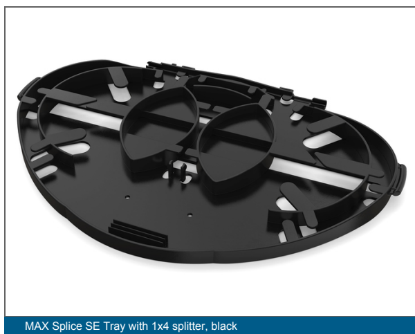
MAX Splice SE Tray with 1x4 splitter, black

The MAX system can be used with either single circuit (SC) or single element (SE) trays or a mixture of both, in accordance with the network requirements. Corning recommends the usage of SC trays. In a Single Element (SE) Network, the fibers from one buffer tube are always stored in one single splice tray. Most network operators are still using 12 fibers per tube. In addition the fibers from up to 6 individual customer drop cables are also guided to one single splice tray. In this case, if maintenance is later required then all the fibers must be taken out of the splice tray. Also, even though the maintenance work may only involve one customer, the maintenance work may often affect the other 5 customers' connections too. With SC Systems this entire risk is eliminated by only using 1 customer per splice tray. One raster unit is required for the SC tray and two are required for the SE tray. Two SC trays can be replaced by one SE tray or vice versa. Additional trays for optical splitters, water sensors or mechanical splices are available. Especially for optical splitter Corning recommends the usage of colored splice trays. The splice trays provide a complete fiber management system with overlength storage, bending control and the possibility of changing the fiber direction. Splice trays can be equipped with numbered and colored rings; thus providing fast and secure access.