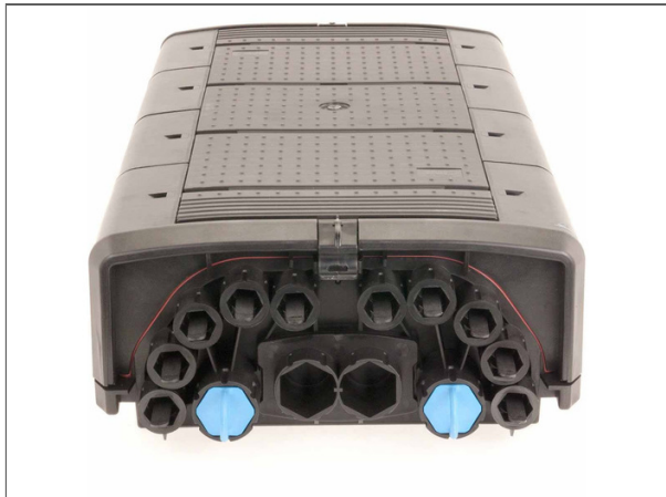
BPEO Fibre Closure, Size 2 End Distribution Point for up to one express cable and up to 12 branch cables, pre-equipped with a 30 High Density Trays for up to 720 splices, for Low Bend Loss radius fibre