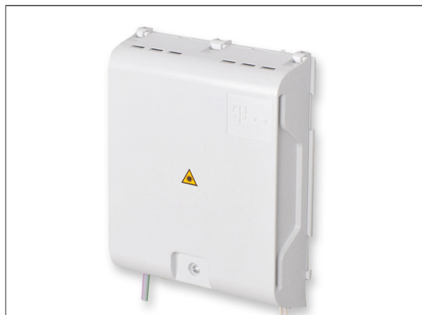
Building Access Terminal (BAT), Size S, grey, EMKA lock, 2 splice trays with 2 heatshrink and crimp splice holders