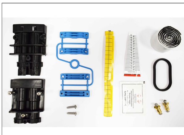
ECAM External Cable Assembly Module for BPEO, BPEO ECAM D27 Round CSM Double-Entry Cable Sealing for mid span access configuration for cable from 5 to 27 mm diameter with central strength members (CSM) such as “ALTOS” cables from Corning or similar