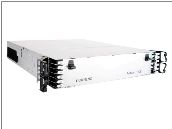
EDGE™ Housing, 2 rack unit, holds up to 24 EDGE modules or panels