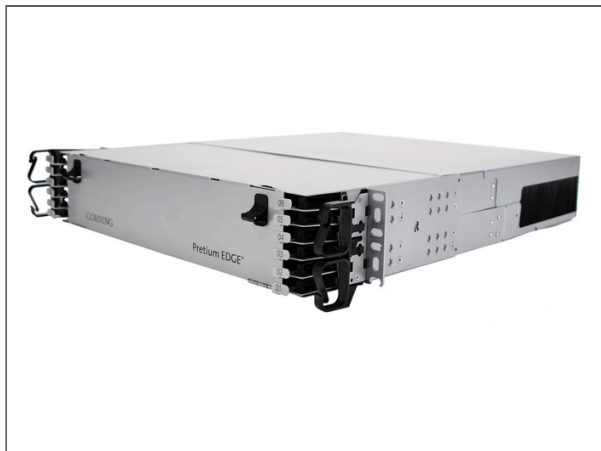
EDGE™ Housing, 2 rack unit, holds up to 24 EDGE modules or panels