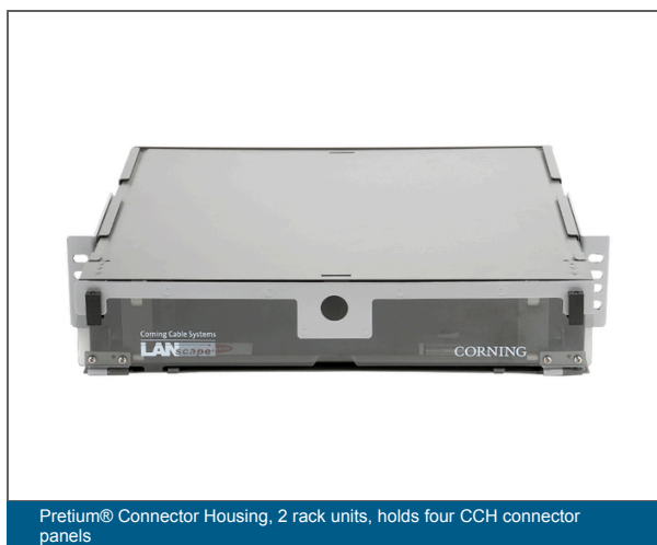
Pretium® Connector Housing, 2 rack units, holds four CCH connector panels

Effectively manage high patch cord densities