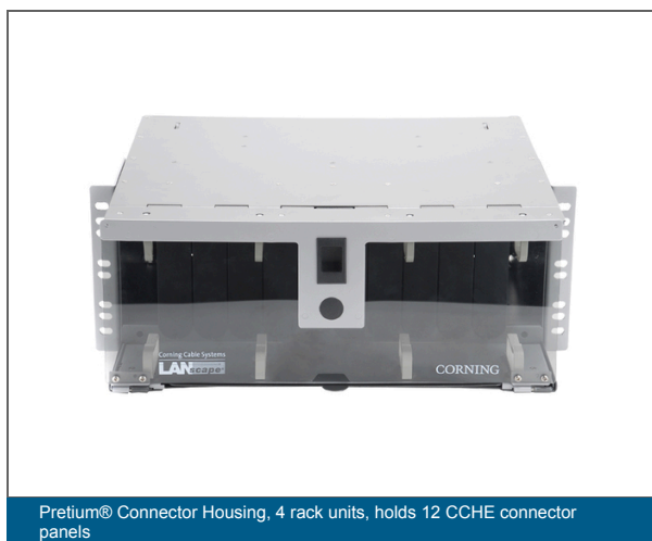
Pretium® Connector Housing, 4 rack units, holds 12 CCHE connector panels

Effectively manage high patch cord densities